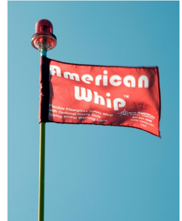
Buggy Whip Flag