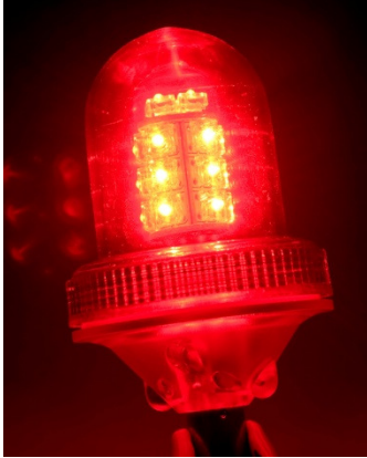
360 Degree LED Warning Light